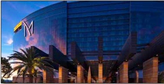
The luxurious M Resort in Las Vegas, home to The Fall Forum: Road to World-Class Performance.

APA's Fall Forum: Road to World-Class Performance is tailored to fit the needs of current and aspiring executive managers and leaders, those who are interested in improving their organization's bottom line, both domestically and globally. The Fall Forum, scheduled for September 16-18 at the luxurious M Resort in Las Vegas , will offer global strategies, innovative practices, and leadership techniques sure to help you maximize resources and control costs in your payroll operation. Register today to ensure your spot at this exclusive, leadership-driven APA conference.