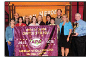
Winning an APA Chapter of the Year Award begins with membership development.

Is your chapter incorporated? Are you filing your chapter's Form 990 or do you have to? What's a 501(c)3? Do these questions come up at chapter meetings? Take advantage of the FREE Chapter Leadership Webinar: Chapter Incorporation & Tax Filing, exclusively for current or future local chapter officers. Learn the information and tips you need to file for tax-exempt status as a nonprofit educational organization.