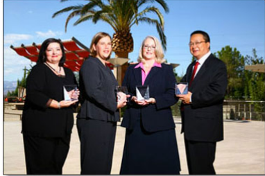
Four payroll departments honored last year for Best Practices.

If your organization has improved business practices and overall processes over the last year, you could very well be the recipient of a 2010 APA Prism Award. Achieving such an award will help your department garner industry-wide recognition, and prove your employees' worth to company officials.