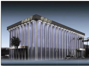
MEET Las Vegas is officially open for business!

After years of careful planning, APA's MEET Las Vegas is officially open for business! The three-story building, located in downtown Las Vegas, features accommodations for conventions, seminars, and of course, payroll-related education. The first floor features a lounge, while the second and third floors offer meeting space and multimedia training space.